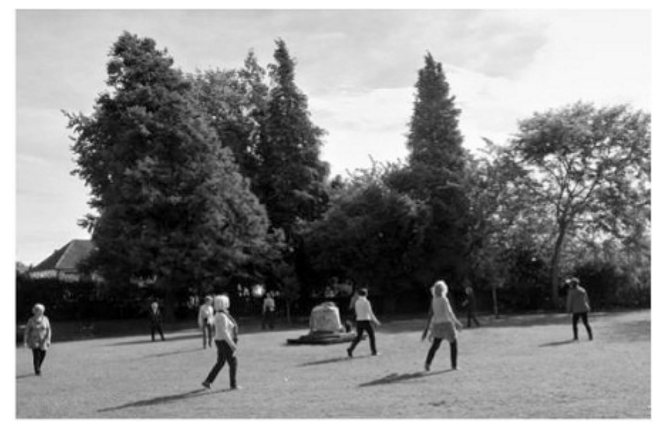
above: dancing at Insole Court gardens

Alongside this has been an opportunity for dancers from different groups to join together at Insole Court gardens (a local Grade II Listed Victorian Gothic mansion with mature enclosed gardens now converted into a community centre) for regular outdoor dancing. Over the last two years we have all discovered that Cardiff weather is far drier than we ever thought – at least on a Thursday morning – and dancing on grass among majestic trees to the song of the birds is where circle dances should be danced!