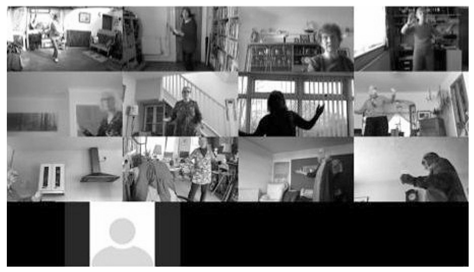
above: dancing on Zoom

The circle dance group in Cardiff has done just that throughout the pandemic – both weekly on Zoom from 5 May 2020 and, at last, in person again from last autumn, fortnightly as before, at Tabernacl Chapel in the city centre. Not quite the same as pre-Covid – a well-ventilated hall, dancers distanced and unjoined, no partners or grand chains – but joyful none the less. What better way is there than dancing to keep your spirits up when the world closes in around you?